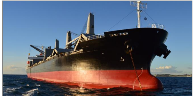
Bulk carrier pre-purchase inspection