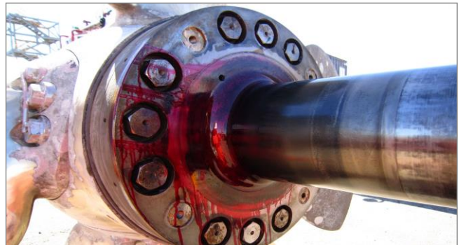
Tailshaft Damage survey, Singapore