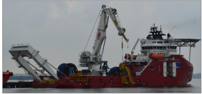
Loadout Operation, Loyang Singapore