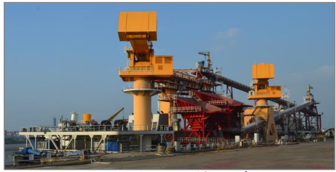
Mining Company Transhipper Modification/Repair Project