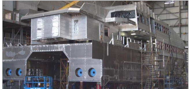
New build construction, Australia