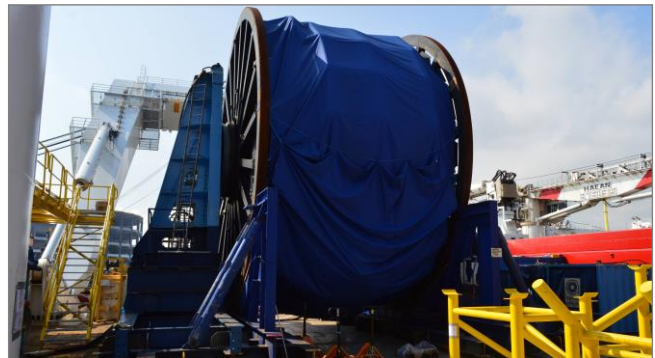
High Value Cargo - Reel Loadout & Seafastening